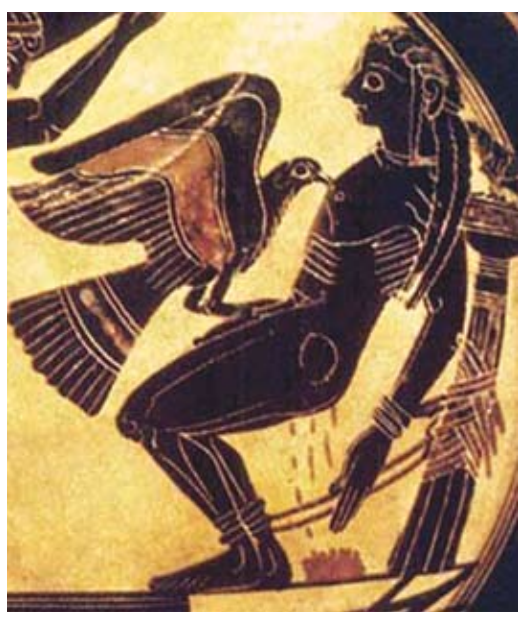
Prometheus depicted on a Greek vase, bound to a stake while an eagle pecks at his heart.

The insertion of the virus of environmentalism into the cell culture of the Baby Boomer generation then became the means by which all could be destroyed. A population embracing a disease which destroys itself—nature's ultimate recipe for self-destruction.