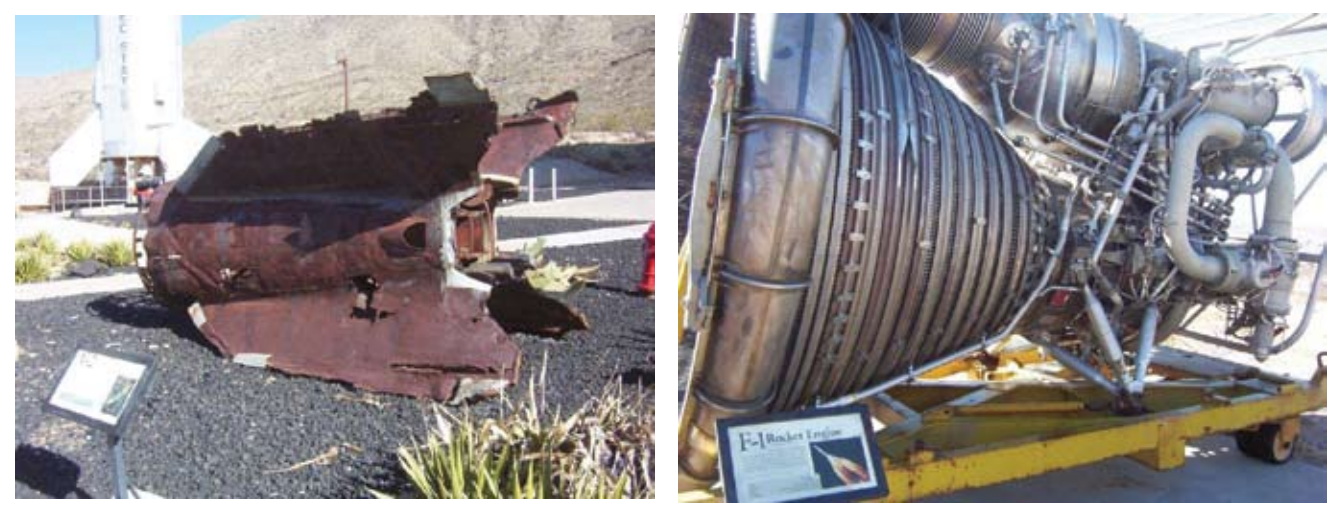
The remains of a V2 rocket on display at the Museum (left) and an F1 rocket engine.

After the end of the war in Europe, in August 1945, 300 train-carloads of German V-2 rocket components arrived at the White Sands Proving Grounds in