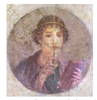
Portrait of Hypatia of Alexandria (370-415), who designed the astrolabe for navigation.